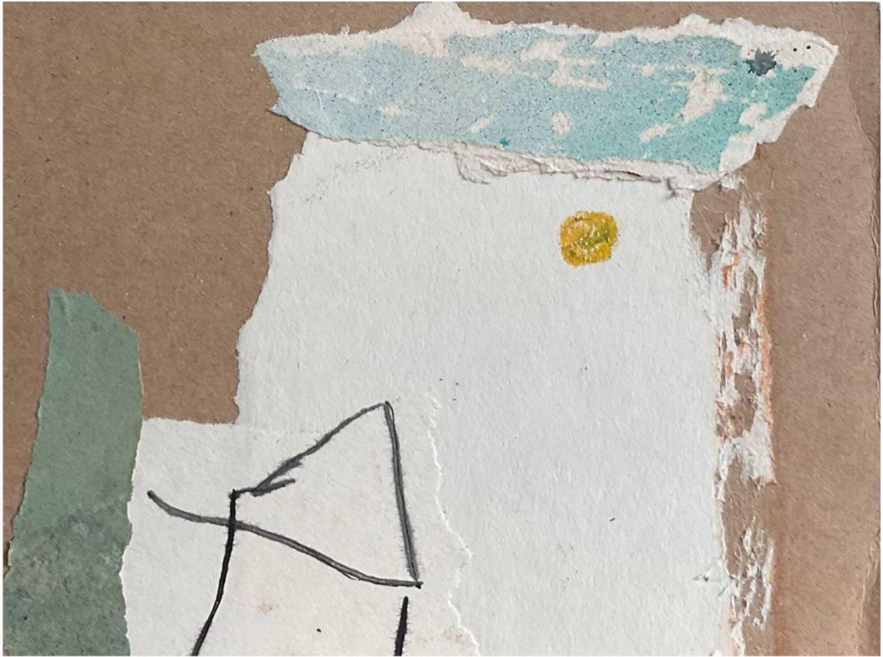
Untitled Collage on cardboard 17x13 cm , 2025