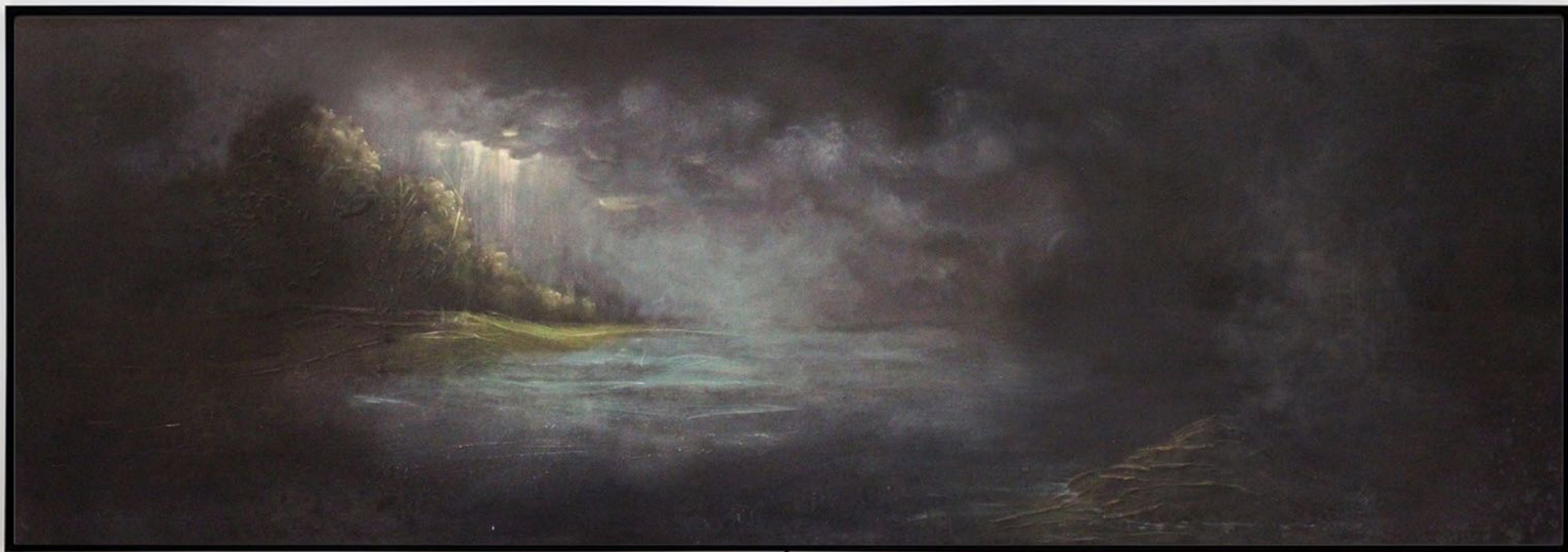
Untitled Oil on canvas 145x50 cm , 2021