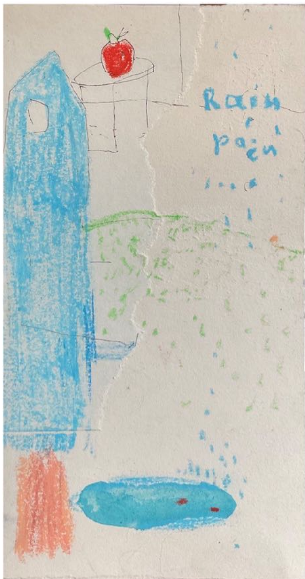
Untitled Collage and Oil pastel on cardboard 14x25 cm , 2025