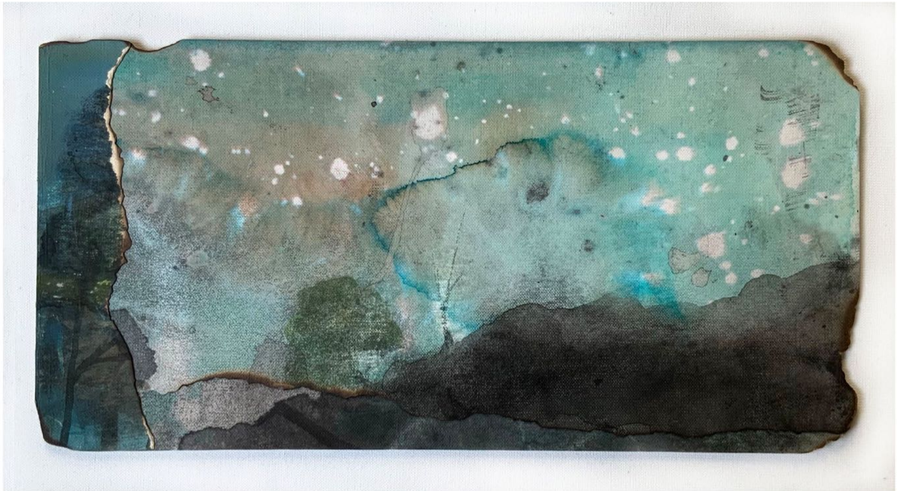
Untitled Mixed media on cardboard and collage 32x16 cm , 2024