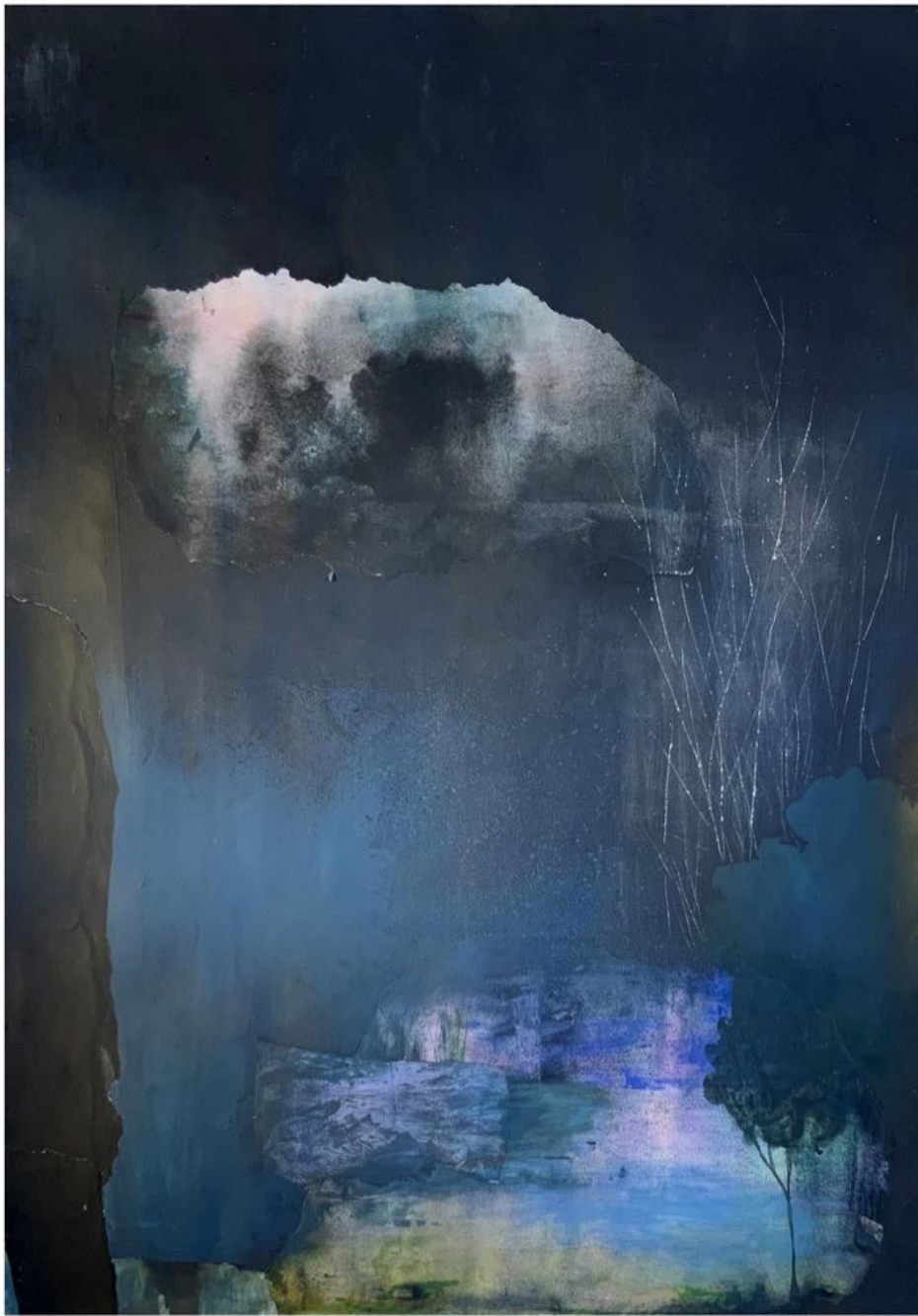
Untitled Collage, acrylic on cardboard 120x70 cm , 2024