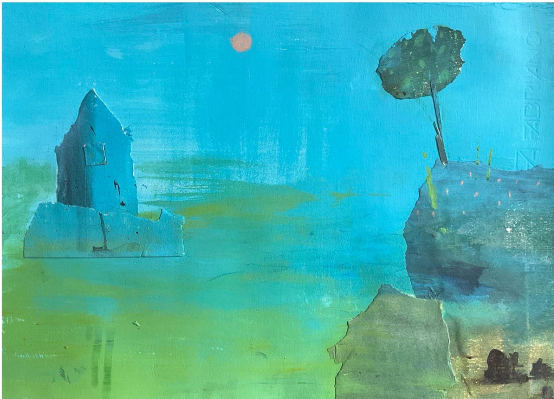
Untitled Collage ,Acrylic and Oil pastel on cardboard 35x25 cm , 2025