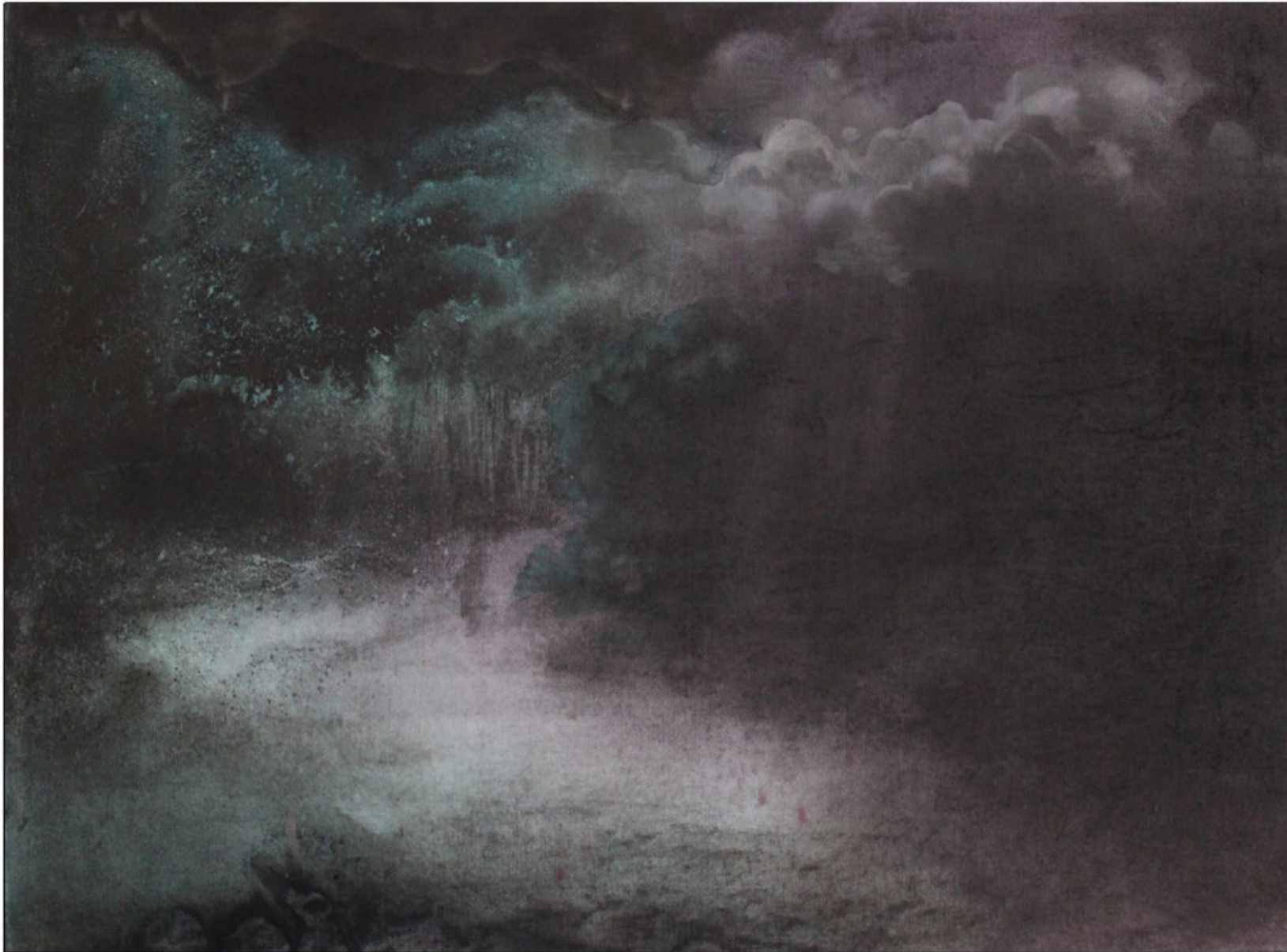
Untitled Ecoline ,charcoal, ink on board 30x40 cm , 2019