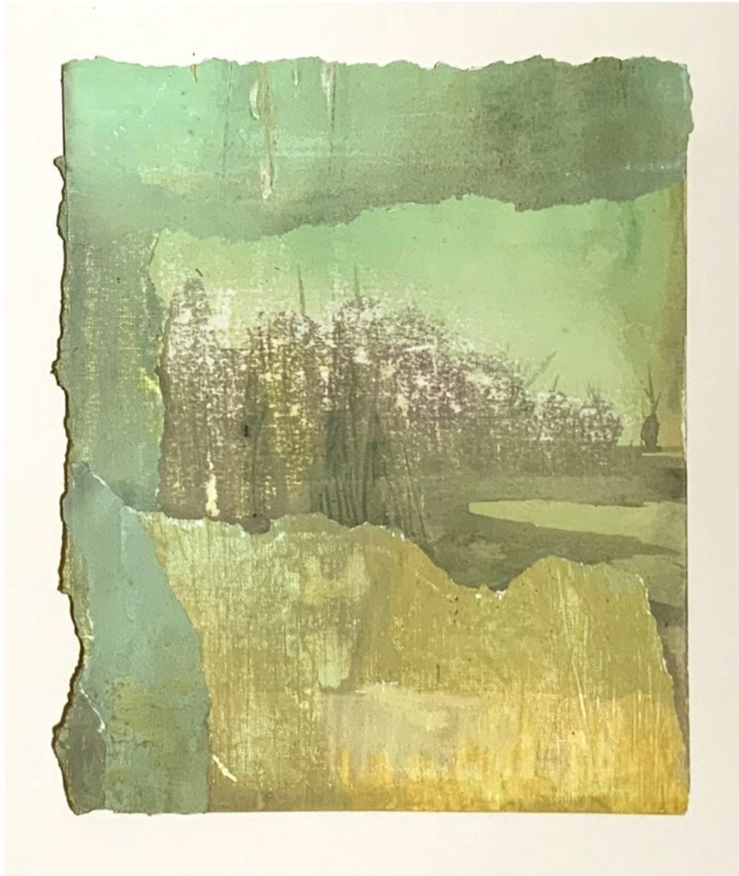
Untitled Mixed media on cardboard and collage 24x26 cm , 2024