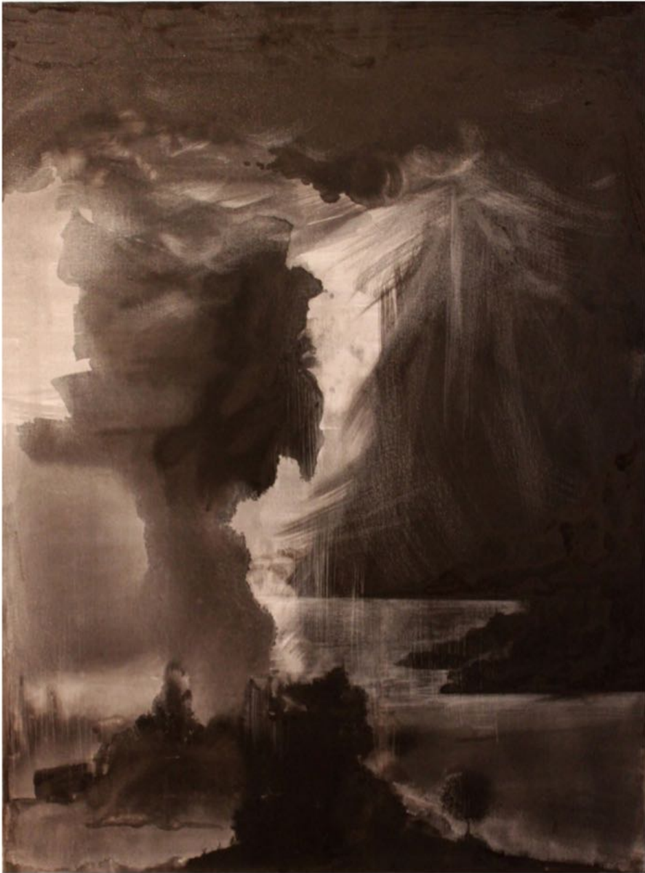
Untitled Acrylic and ink on canvas 50x70 cm , 2023