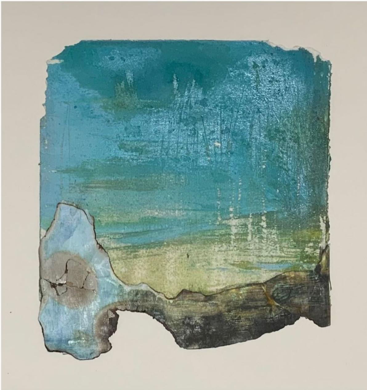
Untitled Mixed media on cardboard and collage 20.5x18.5 cm , 2023