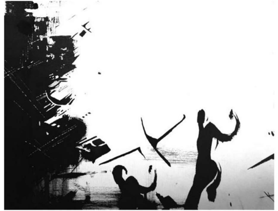
Untitled Ink on cardboard 20x25 cm , 2012