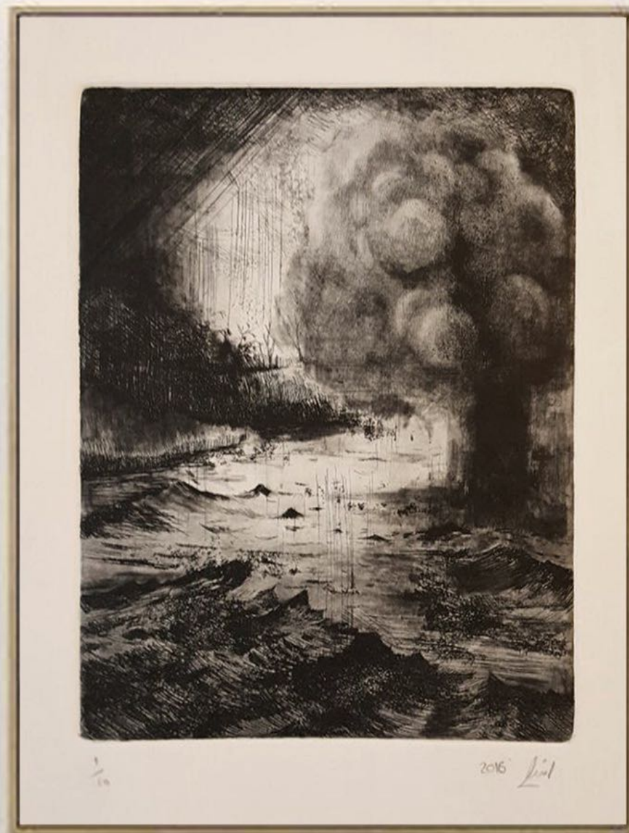
The Mist Intaglio: drypoint, aquatint mezzotint, etching 30x40 cm , 2016