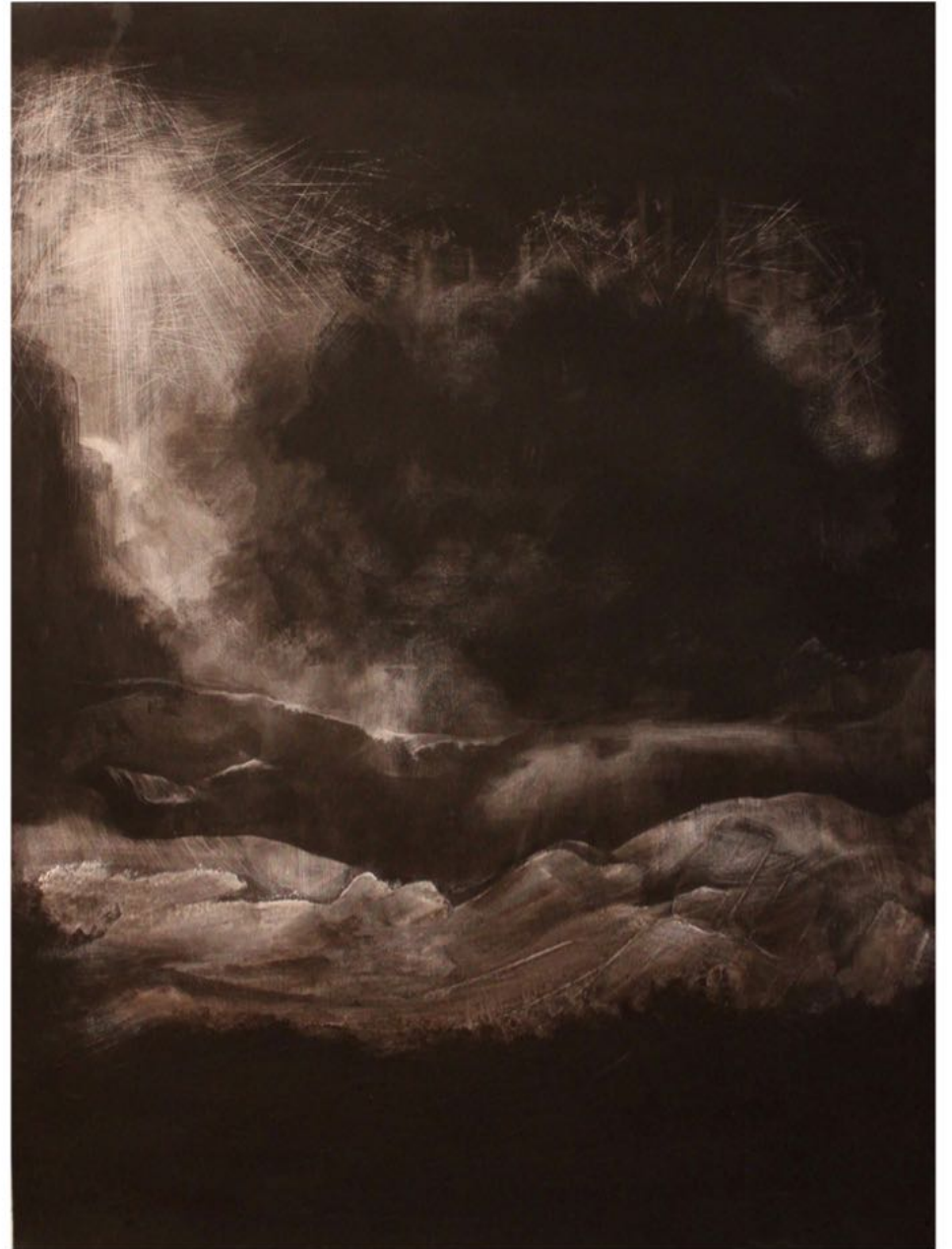
Untitled Acrylic and ink on canvas 50x70 cm , 2023