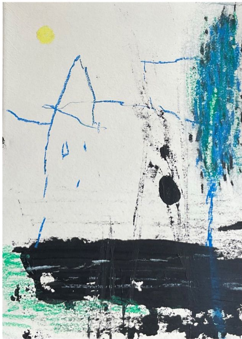
Untitled Acrylic and Oil pastel on cardboard 14.5x21 cm , 2025